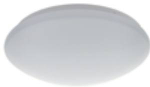
PRATA LED SMD DL-200