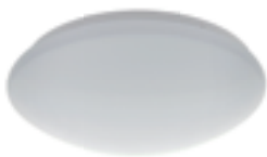
PRATA LED SMD DL-160